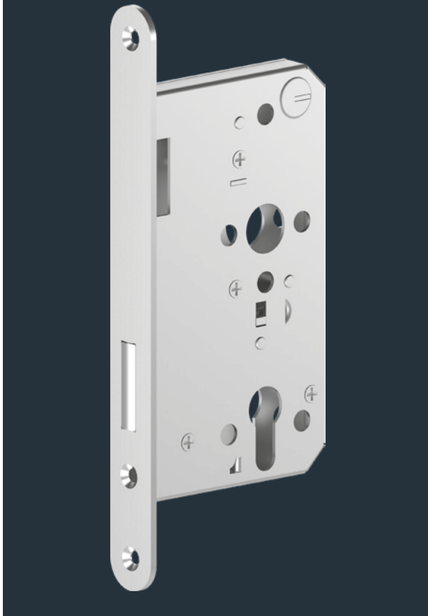
GBS 108 (81 RI)