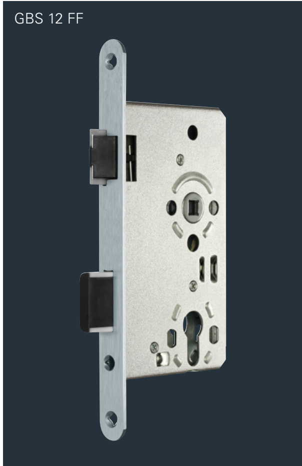
GBS 12 FF